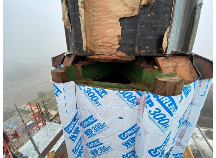
Photo06: More Copper is Removed