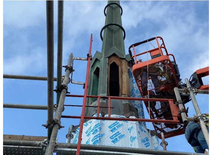
Photo09: Copper Cladding Removed from Upper Level of Steeple

On Site: N/A Temperature – Low/High (°F): 46/55 Rain (Total Inches): 0.20" Max Wind Speed(mph): 22 N Field Note: Comments & Photographs: 02 11-01 Coltzer Company, LLC was not on site due to rain and heavy winds.