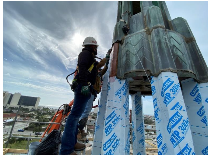
Photo04: Waterproof Membrane Applied on Next Tier