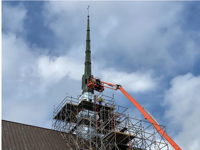
Photo08: Overview of Work in Progress