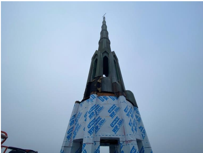
Photo07: Overview of Work in Progress