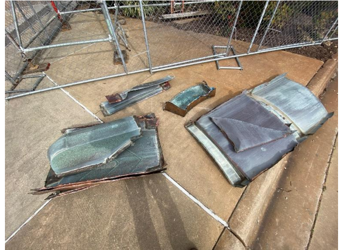
Photo02: Removed Copper Cladding