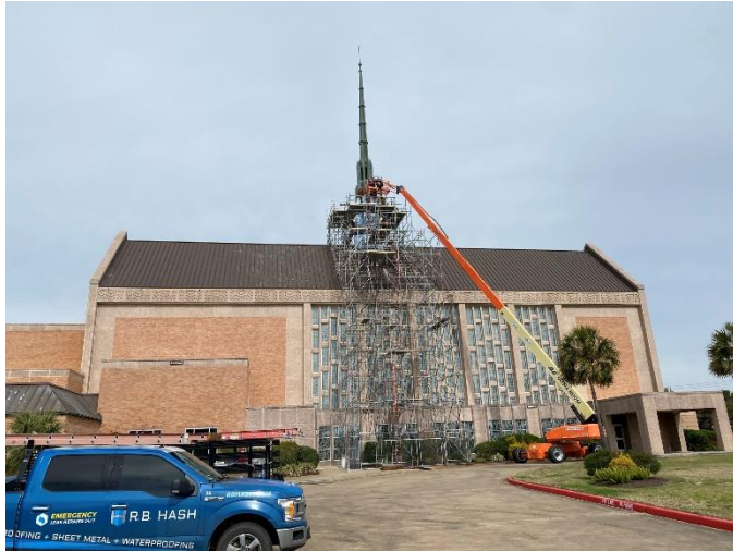
Photo01: Overview of Work in Progress