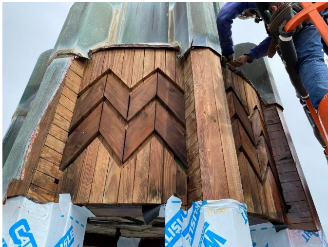
Photo03: Exposed Wood Underneath Copper Cladding