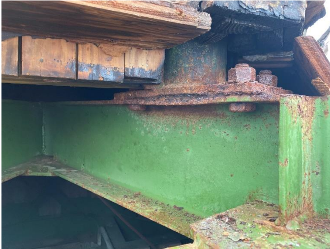
Photo05: Steel Beams Beneath the Copper Cladding