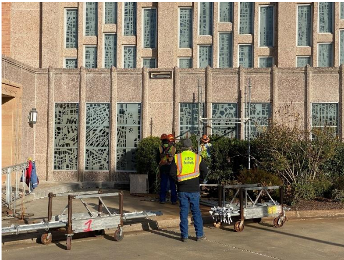
Photo03: Scaffolding Being Assembled