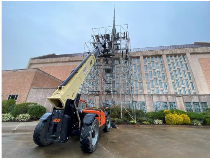
Photo19: Scaffolding Being Assembled on Roof

01 22-02 Betco Scaffolding continues erecting scaffolding on the south side of the sanctuary. Scaffold supports are placed on the roof of the sanctuary. Chain link fence is placed around the scaffolding. ( see photo19-22 )