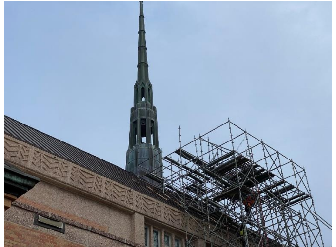
Photo20: Scaffolding Assembled on Roof