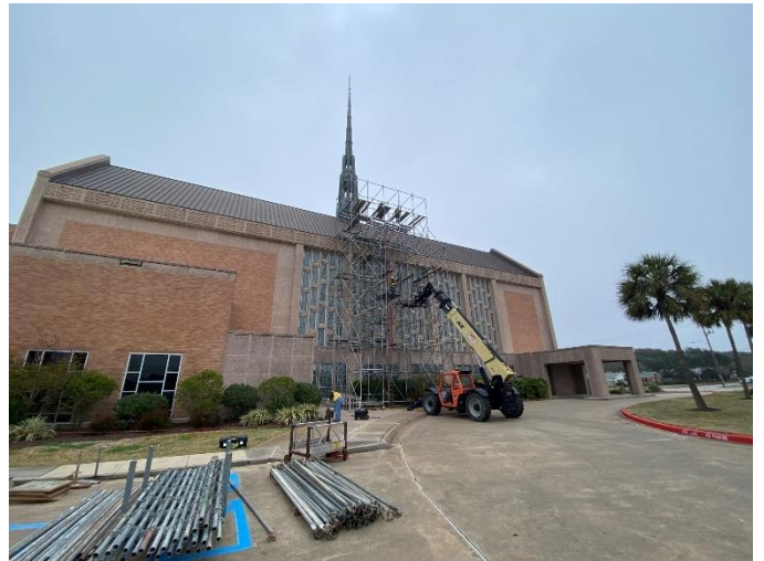
Photo16: Scaffolding Being Assembled Above Roof