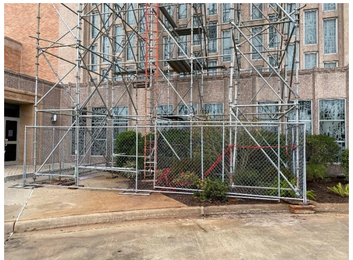
Photo22: Chain Link Fence Around Scaffolding