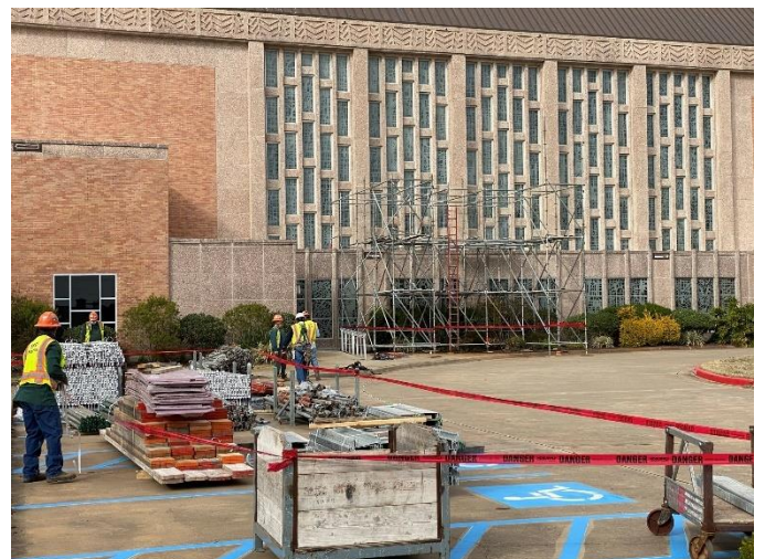
Photo06: Scaffolding Material Laid Out