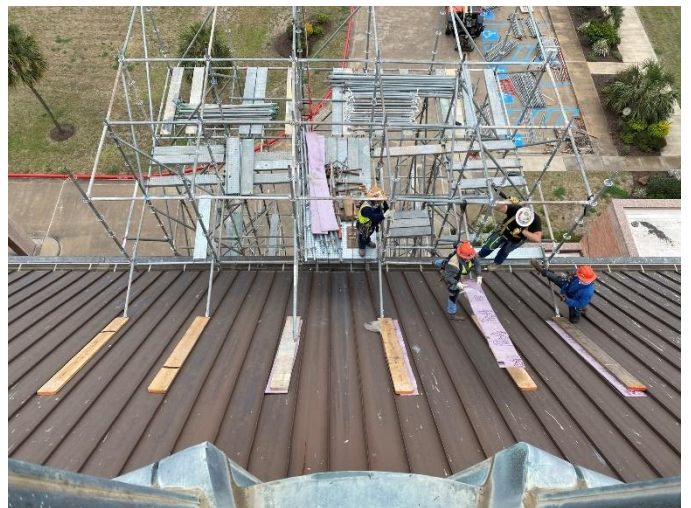
Photo18: Scaffold Supports Being Placed on Roof of Sanctuary