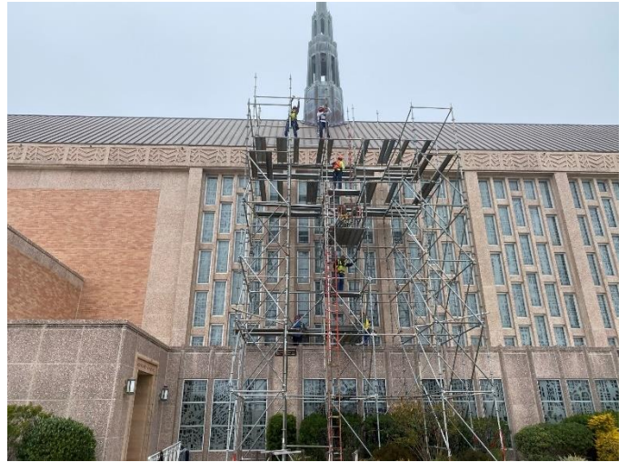
Photo12: Scaffolding Being Assembled