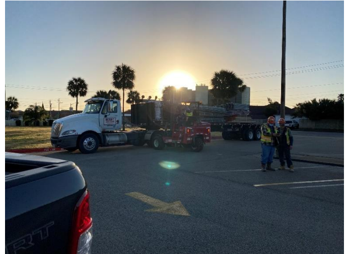
Photo02: Scaffolding Unloaded from the Truck