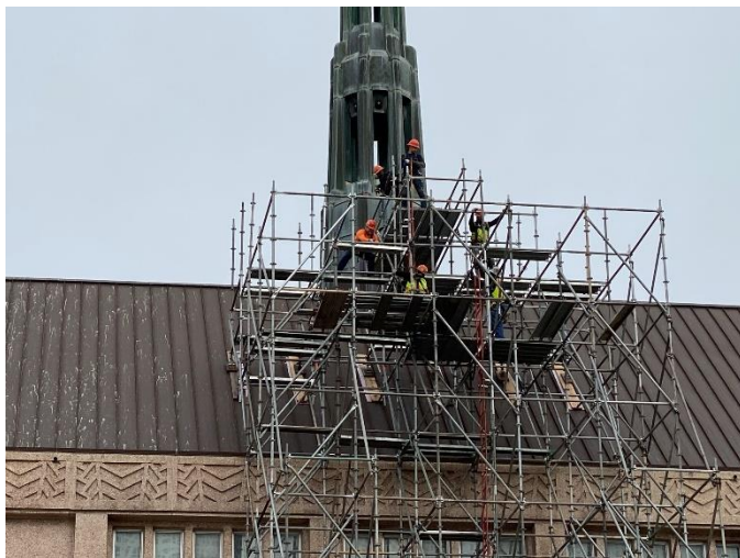
Photo21: Scaffolding Assembled on Roof