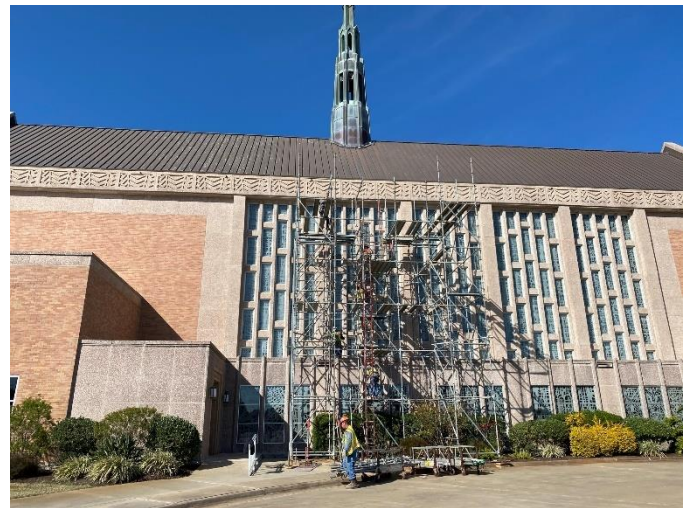
Photo08: Scaffolding Being Assembled