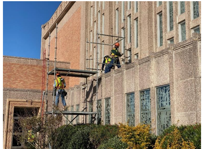
Photo04: Scaffolding Being Assembled