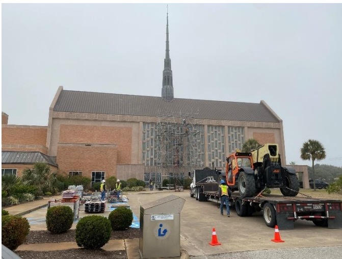
Photo13: Lift Brought in to Help Assemble Scaffolding