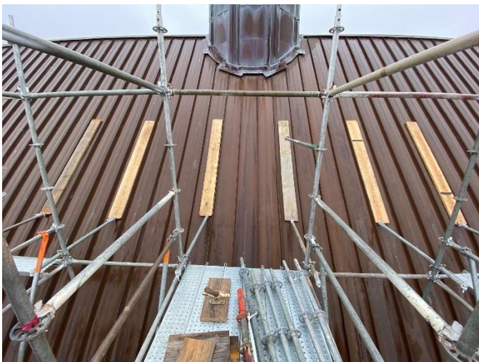
Photo17: Scaffold Supports Being Placed on Roof of Sanctuary