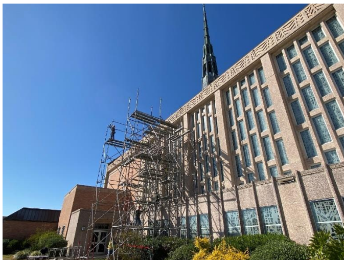
Photo09: Scaffolding Being Assembled