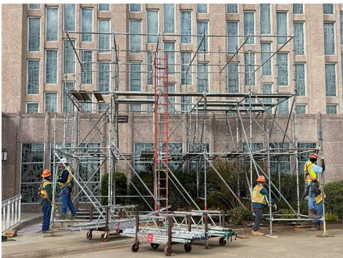
Photo05: Scaffolding Being Assembled