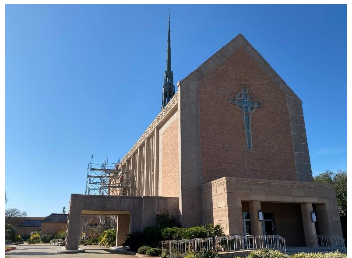
Photo10: 53 rd Street View of Scaffolding