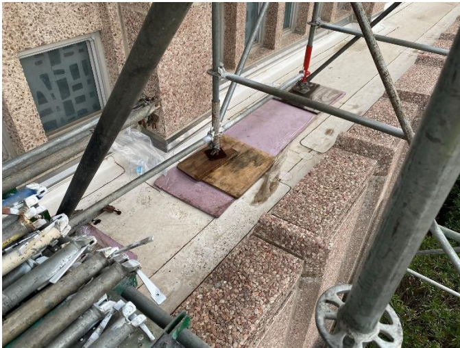
Photo15: Scaffold Supports on Foam and Plywood

01 21-02 Betco Scaffolding continues erecting scaffolding on the south side of the sanctuary. Scaffold supports are placed on the roof of the sanctuary. ( see photo15-18 )