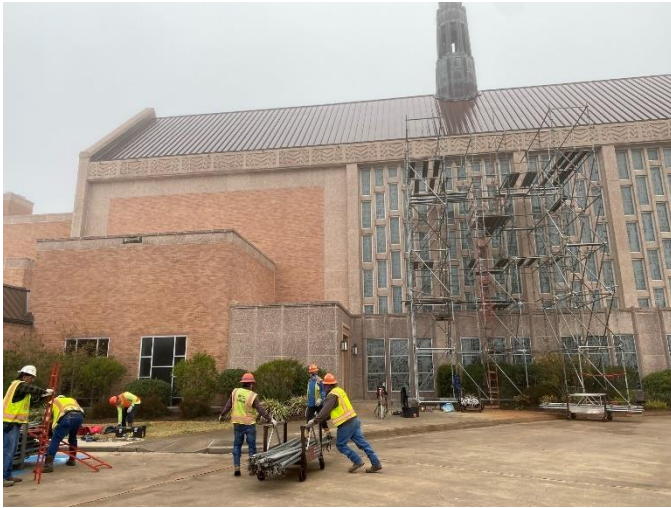
Photo11: Scaffolding Being Assembled

01 20-02 Betco Scaffolding continues erecting scaffolding on the south side of the sanctuary. ( see photo11-14 )