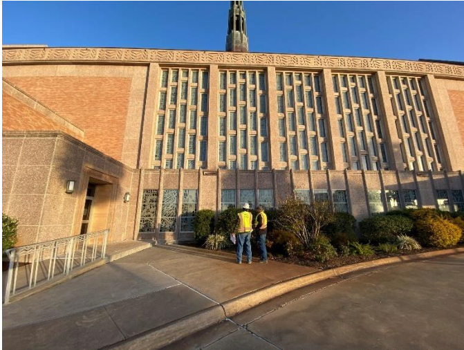
Photo01: Preparing for Scaffolding