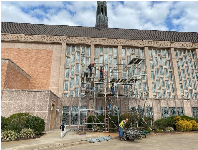
Photo07: Scaffolding Being Assembled

01 19-02 Betco Scaffolding continues erecting scaffolding on the south side of the sanctuary. ( see photo07-10 )