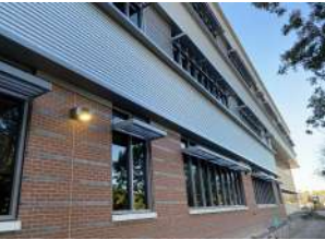
UT Health—Barshop Institute