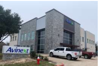
Avinext Office Building