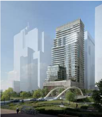
Austin Proper