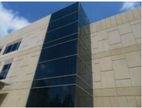
MDACC The Woodlands