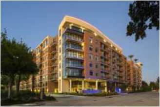
The McAdams